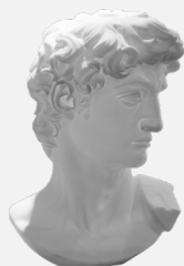
Indoor Sculpture 3D Printing