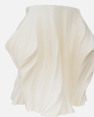
Display Props 3D printing